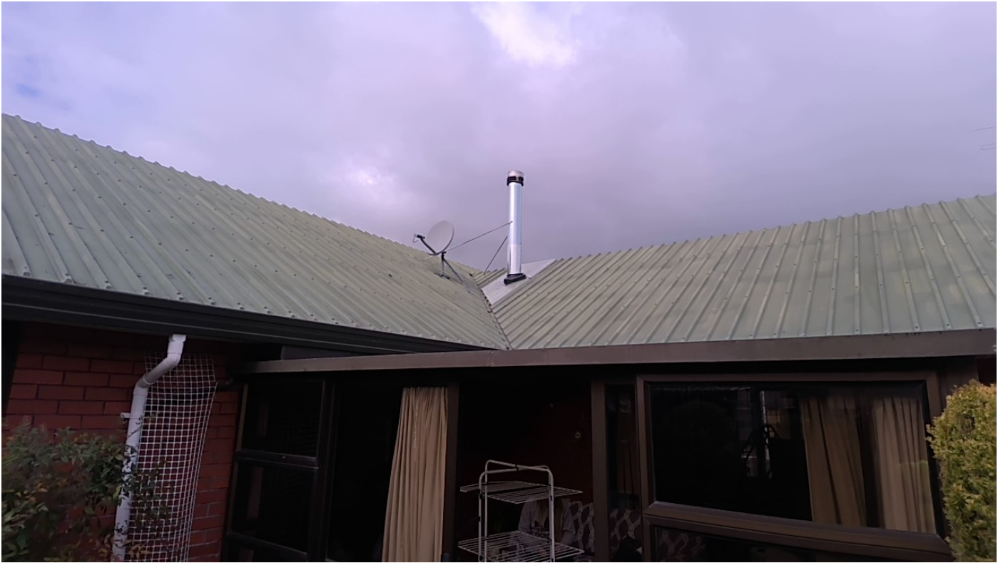
Taken at 1:15 PM on Thursday 21/08/2025