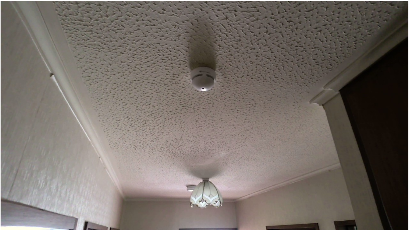
Taken at 1:17 PM on Thursday 21/08/2025