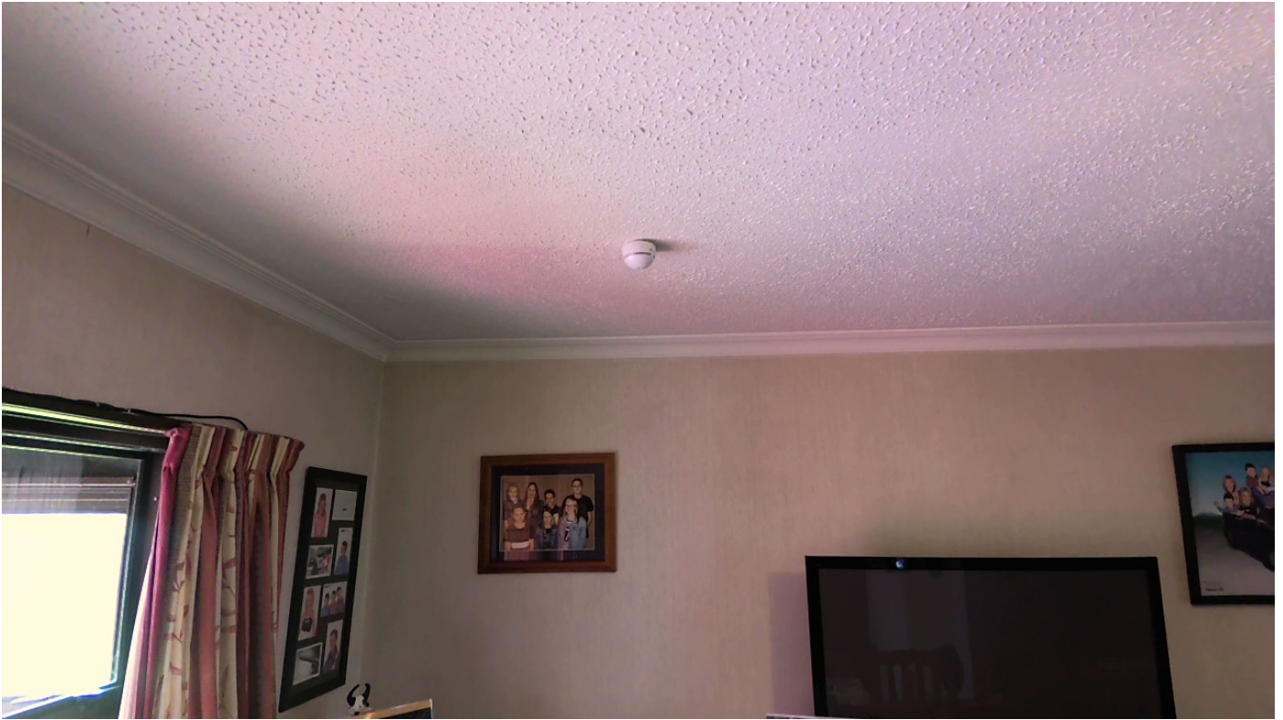
Taken at 1:17 PM on Thursday 21/08/2025