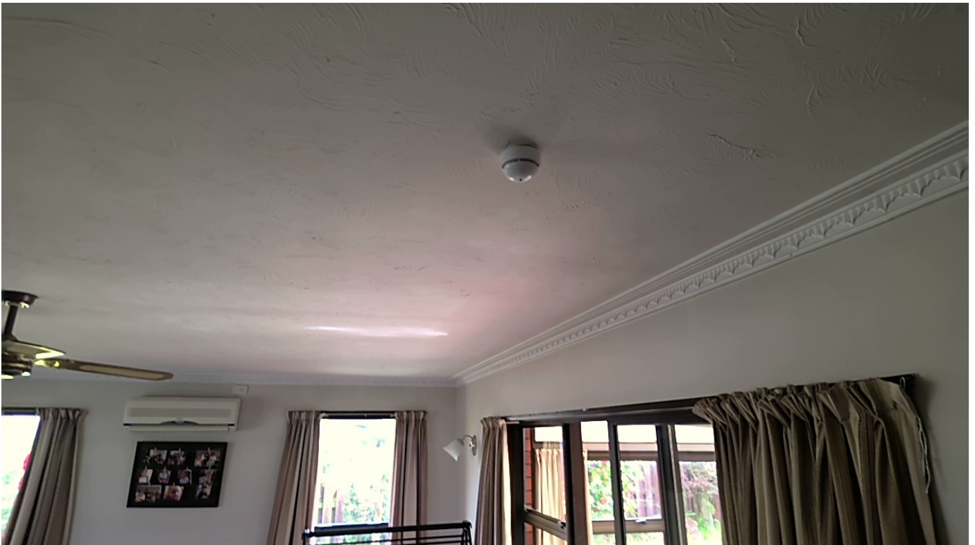
Taken at 1:17 PM on Thursday 21/08/2025