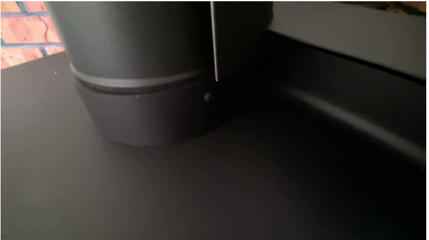
Taken at 1:06 PM on Thursday 21/08/2025