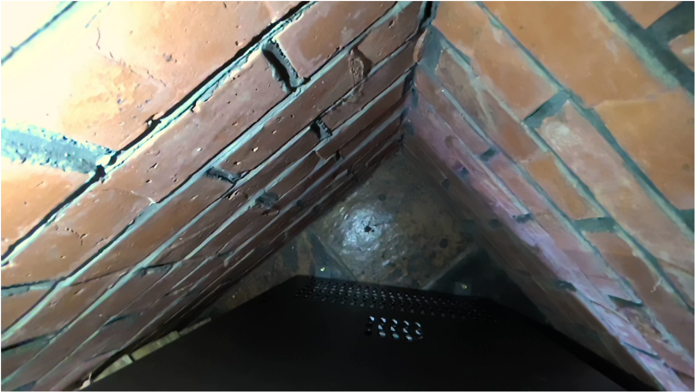
Taken at 1:09 PM on Thursday 21/08/2025