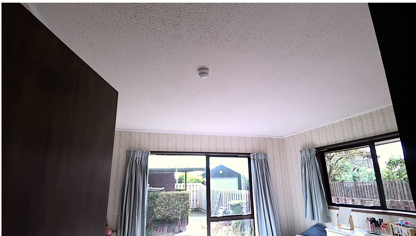
Taken at 1:18 PM on Thursday 21/08/2025