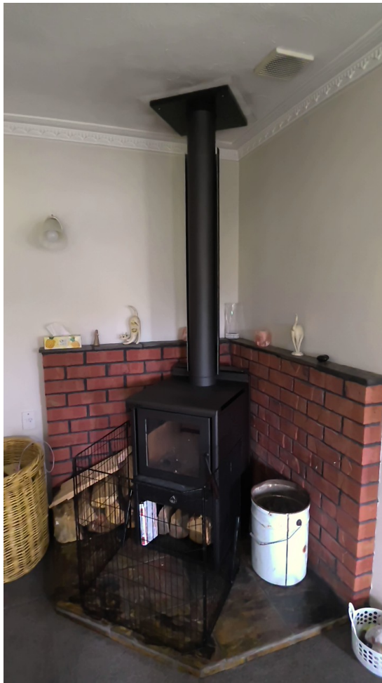
Taken at 1:06 PM on Thursday 21/08/2025