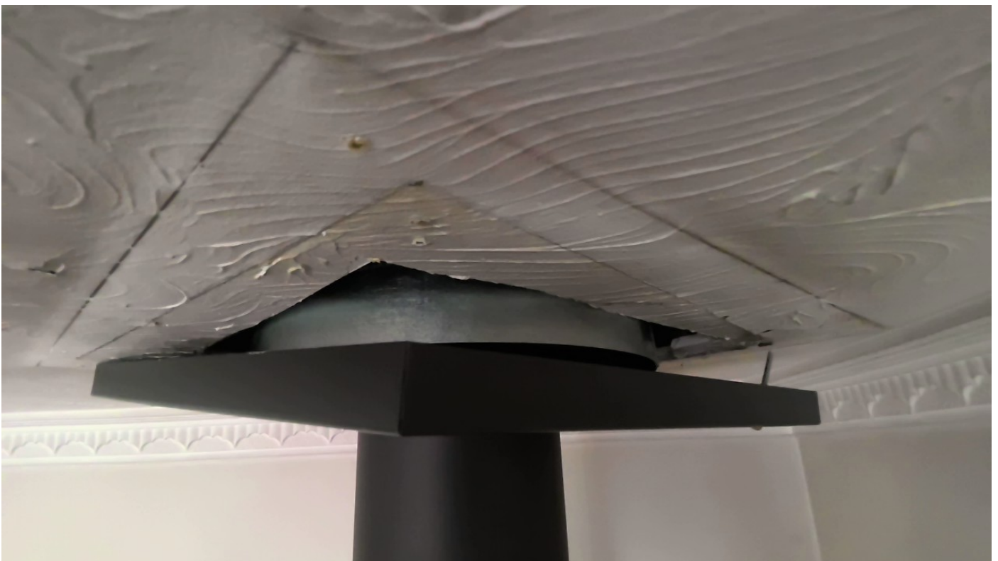
Taken at 1:12 PM on Thursday 21/08/2025